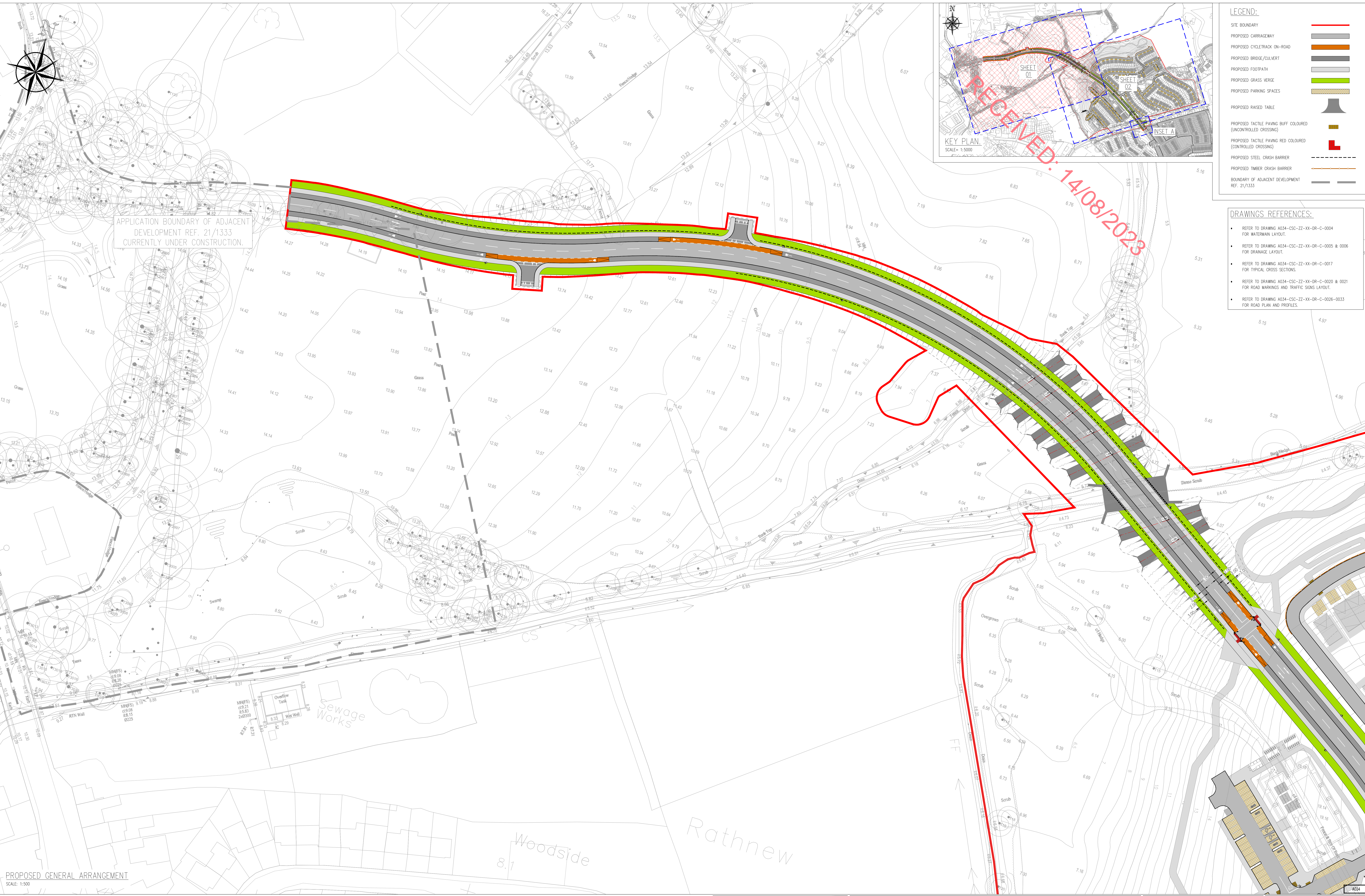
PROPOSED GENERAL ARRANGEMENT SCALE: 1:500

APPLICATION BOUNDARY OF ADJACENT DEVELOPMENT REF. 21/1333 CURRENTLY UNDER CONSTRUCTION.